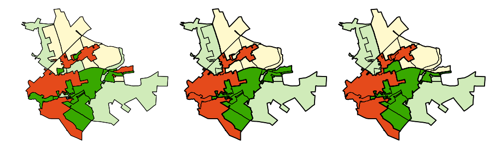
Fig. 1: A sample from the ATKIS DLM 50 (left), an optimal result satisfying specifications for ATKIS DLM 250 (center) and a result of +9% higher costs that was obtained with heuristics 1-3 (right). Boundaries of regions are bold, colors correspond to classes as shown in Tab. 2.