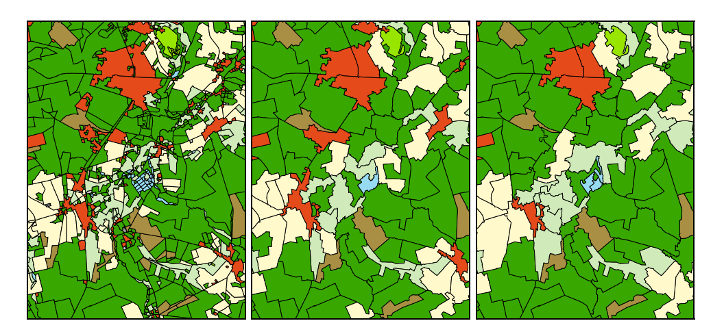
Fig. 3 : A sample from the ATKIS DLM 50 (left), a result of the heuristic developed by Haunert (2007b), and a result of a simple iterative merging procedure (right). Both results satisfy the specification for the ATKIS DLM 250.

such as typification. In fact, pattern recognition techniques are often applied in map generalization. However, metrics are missing that measure the semantic distance between patterns. Additional research is needed to test the effect of asymmetric class distances. Concerning local search methods for optimization such as simulated annealing we see the need to improve techniques to handle hard constraints, which are needed for logical consistency in map generalization. Future research is also needed to consider additional elements of quality, for example, positional accuracy and completeness. So far we have interpreted the size thresholds in the specifications as prohibition to keep too small areas in the target scale, but there might be size thresholds or other criteria that define which areas must be kept in the generalized map to ensure completeness. In fact classes of areas can be fixed in our optimization approach (Haunert & Wolff 2006), thus the method can ensure completeness, if we define which areas to keep.